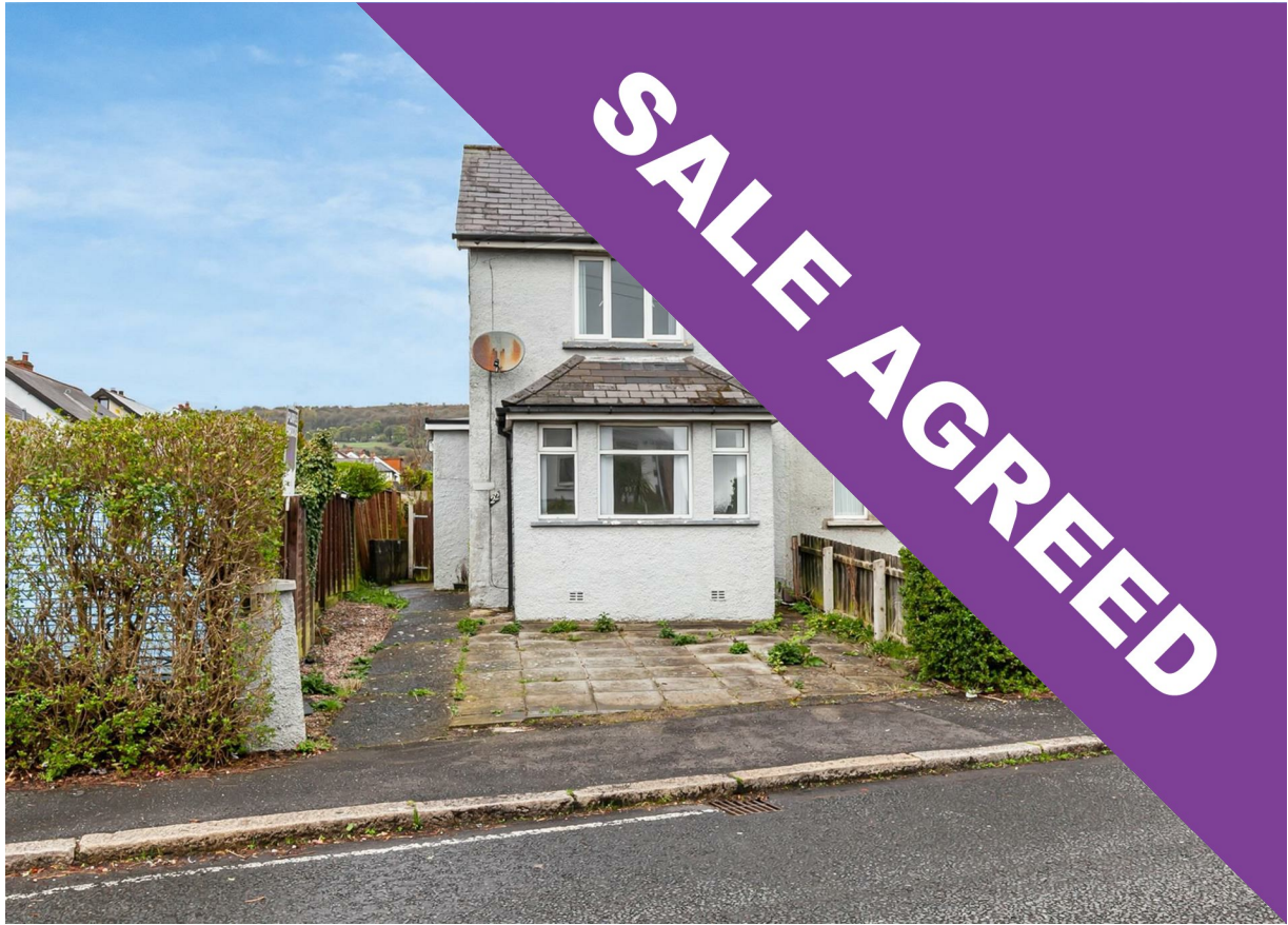
22 Wallasey Park, Belfast, BT14 6PN